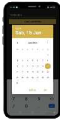
Fig. 13. Date Options View Previous Reports

After selecting the date to be viewed, something like Figure 12 will appear where the user must save the image by pressing save and the image will be automatically saved to the gallery. The results will be reported to the company..