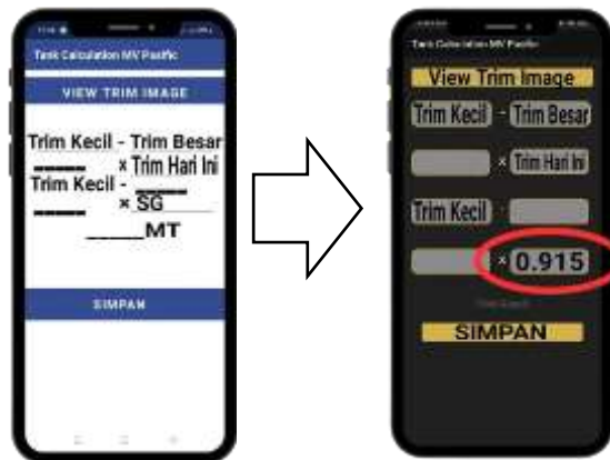
Fig. 5. Display of SG (Specific Gravity) Values in the Application Before and After Revision

Apart from that, there is also something that needs to be fixed in the calculation input menu page which is in the table specific gravity still requires you to enter numbers manually, the examiner suggested that the specific gravity table be filled in automatically because the numbers are patented so that it is easier and more practical, there is no need to fill it in and so it is faster to fill in. The results of this calculation are sent to the company every day. The results before revision and after revision of the specific gravity table are as shown in Figure. 5.