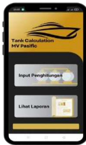
Fig. 9. Dashboard Menus