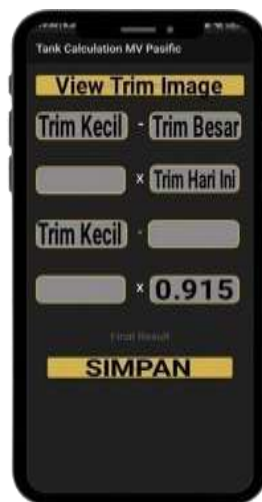
Fig. 11. Calculation Pages