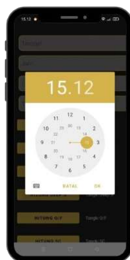
Fig. 8. Automatic Clock Options

Validator 1 suggests adding a save button so that users can save the results of this report in the cellphone gallery automatically and the results of this report can be saved in the form of a photo in the cellphone gallery.