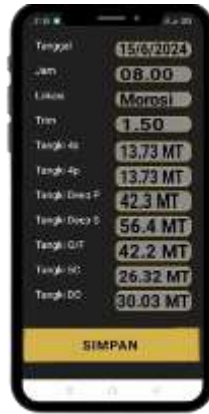
Fig. 12. Calculation Summary Results