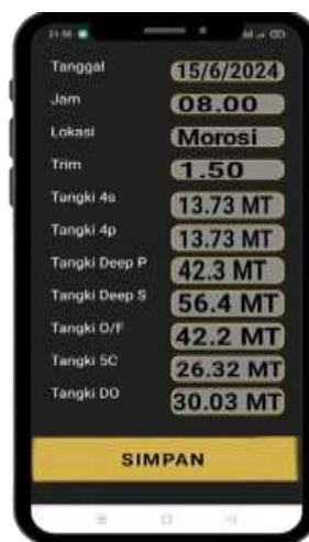
Fig. 7. Added Save Button to Report Results

The final stage is product refinement. This is the final stage of the process of creating an Android-based fuel calculation application on MV. Pacific Bulk. The product is made through several stages starting from stage 1 testing to stage 3 testing accompanied by revisions to obtain a product that is perfect and can be used well. After the product is finished, a validation test is carried out by a validator, where the product is tested by the validator to see whether the product is ready to use or not and also asks for suggestions to complete what is still lacking in the application in order to obtain perfect product results. From this validation, suggestions from the validator were obtained, including adding options to the calculation report as shown in Figure . 7 and added an automatic clock option as shown in Figure . 8.