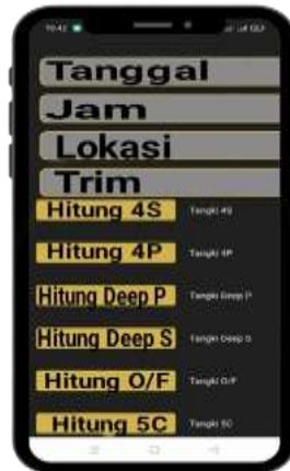
Fig. 10. Pages Tank Count